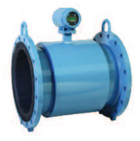
Magnetic bi-directional flowmeter with stainless steel electrodes, 4-20 mA output, local display, NEMA 4X housing, and no moving parts to wear out