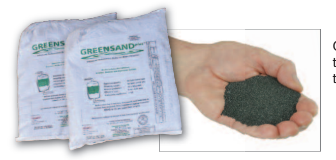
Genuine GreensandPlus<sup>™</sup> filtration media – tried, proven, and recognized standards in ten states and AWWA B 102-04